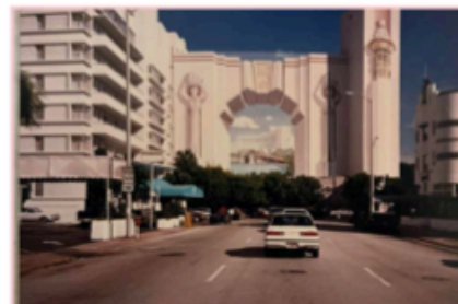
Richard Haas mural on Fontainebleau Hotel