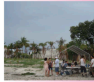
BBQ in Palm Lot