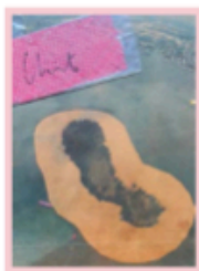
Signed pink material from Christo and Jeanne-Claude's Surrounded Islands , Biscayne Bay, Greater Miami, Florida, 1980-3