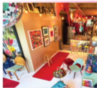
El Speakeasy in Little Haiti, Miami.