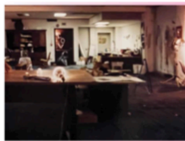
The Bank at the corner of Flagler St and NE 1st St, Miami.