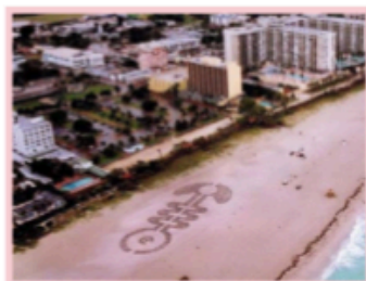
Carlos Betancourt, Sound Symbols Project , 2000, Miami Beach