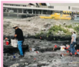
Miami Circle archeological site