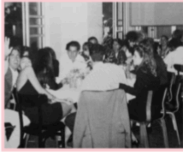
The Strand Miami Beach, 1987

same door person, all going to the same places attracted by the same visual language and vibe. I remember when artist Keith Herring opened a Pop Shop on 5th Street called Wham Bam , we knew similar people and went to the same places, the same when Kenny Scharf arrived to Miami Beach .