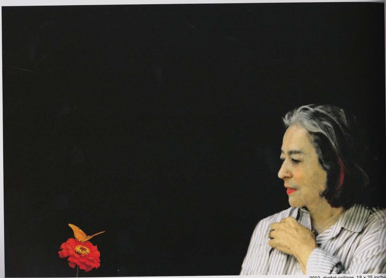
2010, digital collage, 18 x 25 inches

I finished the composition a couple of months later in the studio in Miami. I omitted the original background and assembled a simple digital collage as an attempt to capture Joan: full of appreciation, gratefulness, and an enthusiastic, contagious awareness of the world that surrounds her.