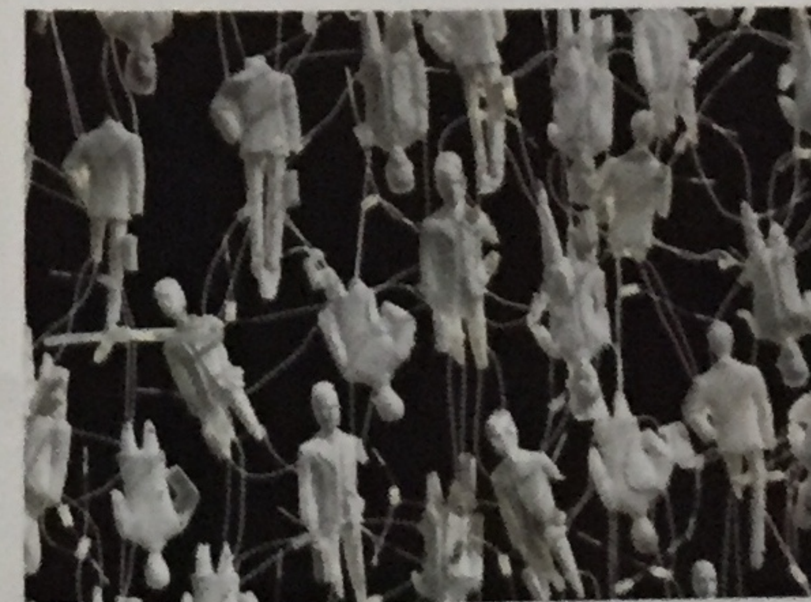
Kenya (Robinson), Installation Image , 2017, © Kenya (Robinson) Image, courtesy of Pioneer Works, Photo by Dan Bradica.