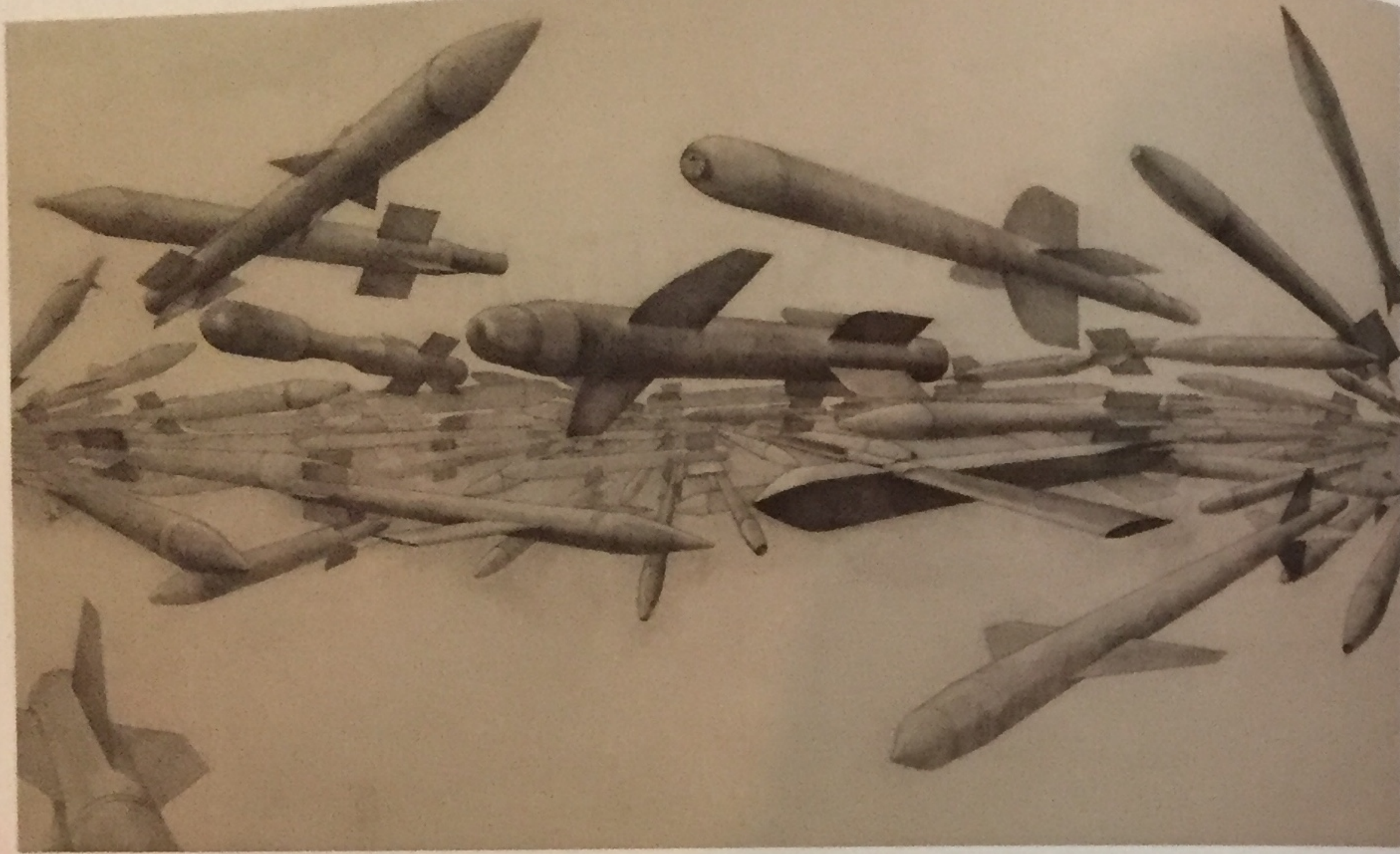
Glaxis Novoa, Ongoing Conversation , 2016, Graphite on canvas, 64 x 112 inches. Courtesy of David Castillo Gallery, Miami Beach, © Glaxis Novoa Image, courtesy of the artist and the David Castillo Gallery, Miami Beach.