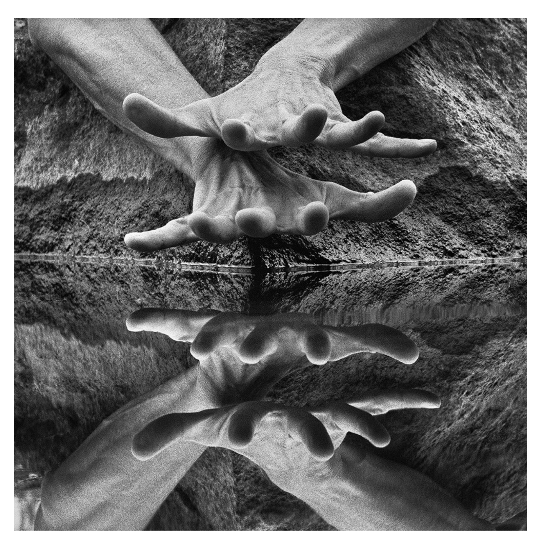
Kallavesi ©Arno Minkkinen