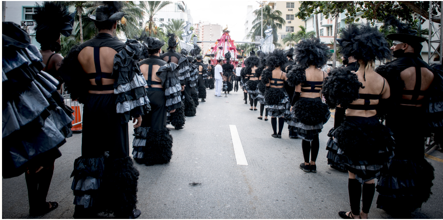
Los Carpinteros, Conga Irreversible , 2016.

The outcome of a two-year collaboration on an unprecedented district- and city-wide scale, with more than 30 South Florida cultural institutions and hundreds of participants, Tide by Side took the form of a processional performance that provided a framework for a collective celebration of, and reflection on community and creation.