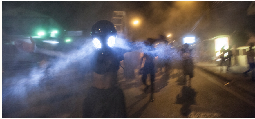
Marlon Griffith, POSITIONS + POWER, 2014.

EN MAS': Carnival and Performance Art of the Caribbean explores the influences of Carnival on performance art in the Caribbean, North America, and Europe and considers a history of performance that does not take place on the stage or in the gallery but rather in the streets, addressing not the few but the many. Nor does EN MAS' trace its genealogy to the European avant-gardes of the early twentieth-century but rather to the postcolonial cultural and political transformations that shaped modern Caribbean society.